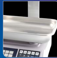
Optional Fish Pan