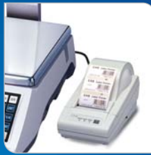
Optional Label Printer