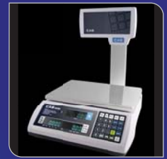
VFD Pole Model